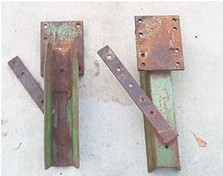
Figure 2: View of #45 axle mounts prior to electrolytic cleaning.

After it appears that the part has had all of its rust converted to black oxide, take it under running water and scrub it with a wire brush or some Scotch-Brite® to remove the loose black oxide. Don't work too hard. If it still has paint or rust on it, cook it some more and work on something else. You'll note the pits will remain, as there is nothing we can do to replace the metal that is gone, but now the part is rust-free. If it needs more time, put it back into the bath. On a particularly rusty piece, you will find that if you remove the part and give it a good scrub, and then put it back in, it will speed up the process. Now dry it and prime it or oil it if it needs to remain natural. By the way, a pressure washer works very well here, too (See Figures 2 & 3).