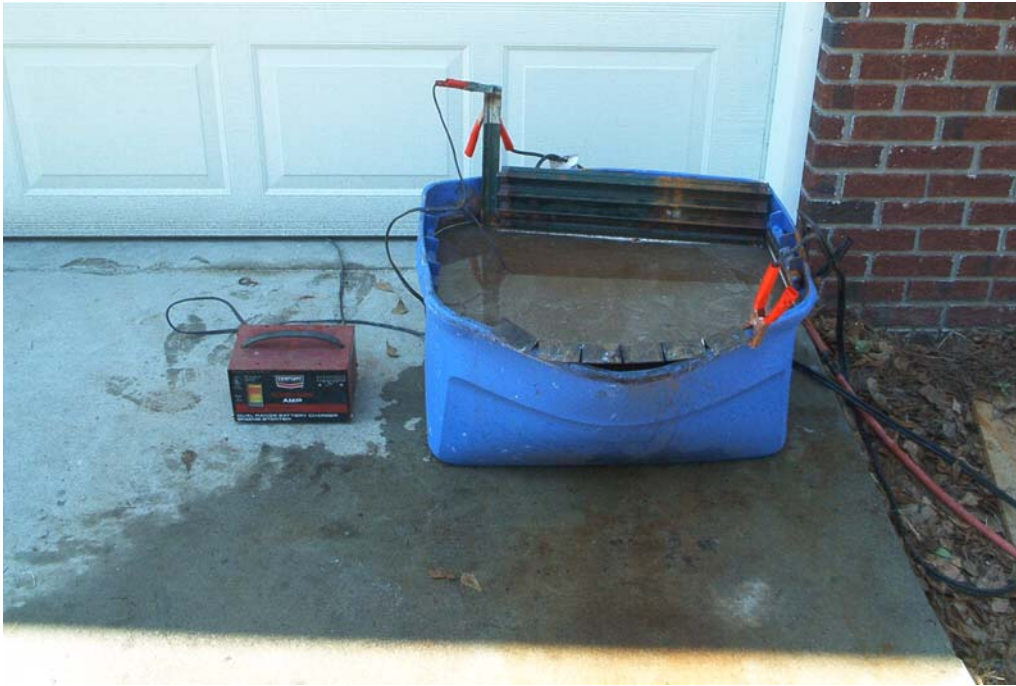
Figure 1: Electrolytic Bath in Action (two electrodes). Charger reads approximately 6 amps.