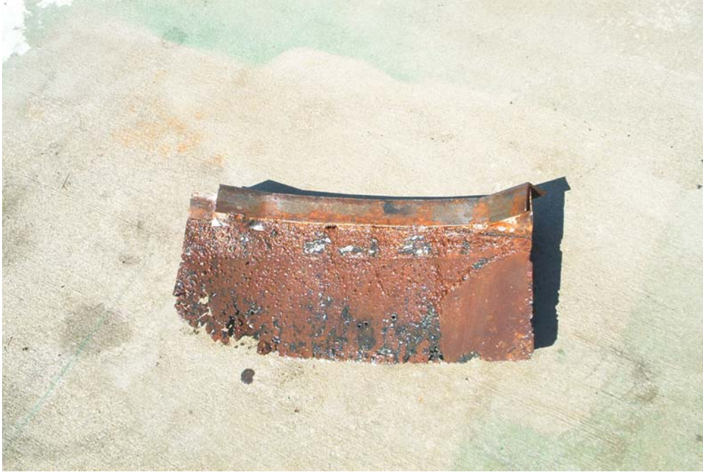
Figure 4: My original 16 Ga. sheet steel electrode is nearing retirement !